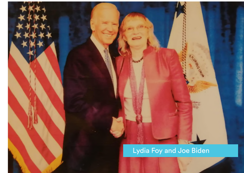
Lydia Foy and Joe Biden

what they are going through, it will help you both support each other and understand each other better. Encouraging your child to socialise with other LGBTQIA+ young people through various youth groups which are all over the country is another positive step, meeting people like them will greatly help them with their own confidence and self-acceptance. There are now so many ways that young trans people can live happy and fulfilled lives, with the passing of the Gender Recognition Act it is now so much easier to transition smoothly both officially and personally. I would tell any parent of a trans child: love and support them, they are becoming the person they were born to be. It may be different from the person you thought they would become, but they are becoming the person they are meant to be. Be there for them, listen to them, support them, love them and they will give you the same back.